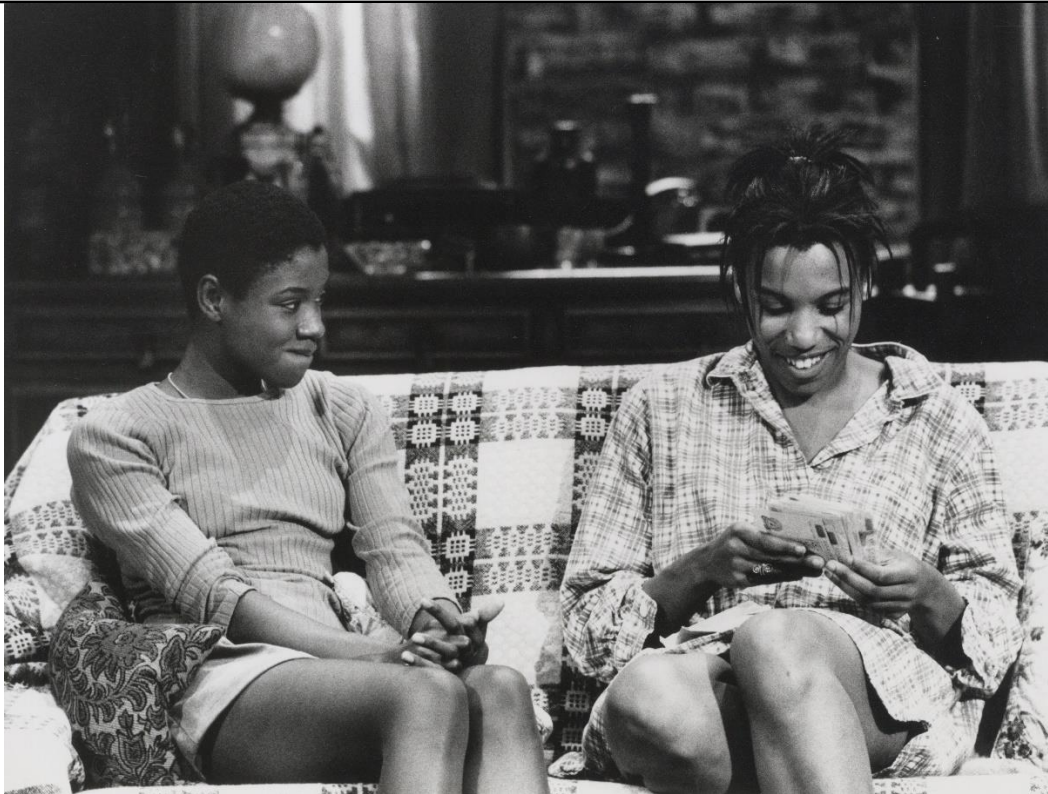
Production photograph of Leave Taking (1994).

Inua Ellams' adaptation of Chekhov's Three Sisters (2019) can be approached in the same way as suggested above. However, you can also: