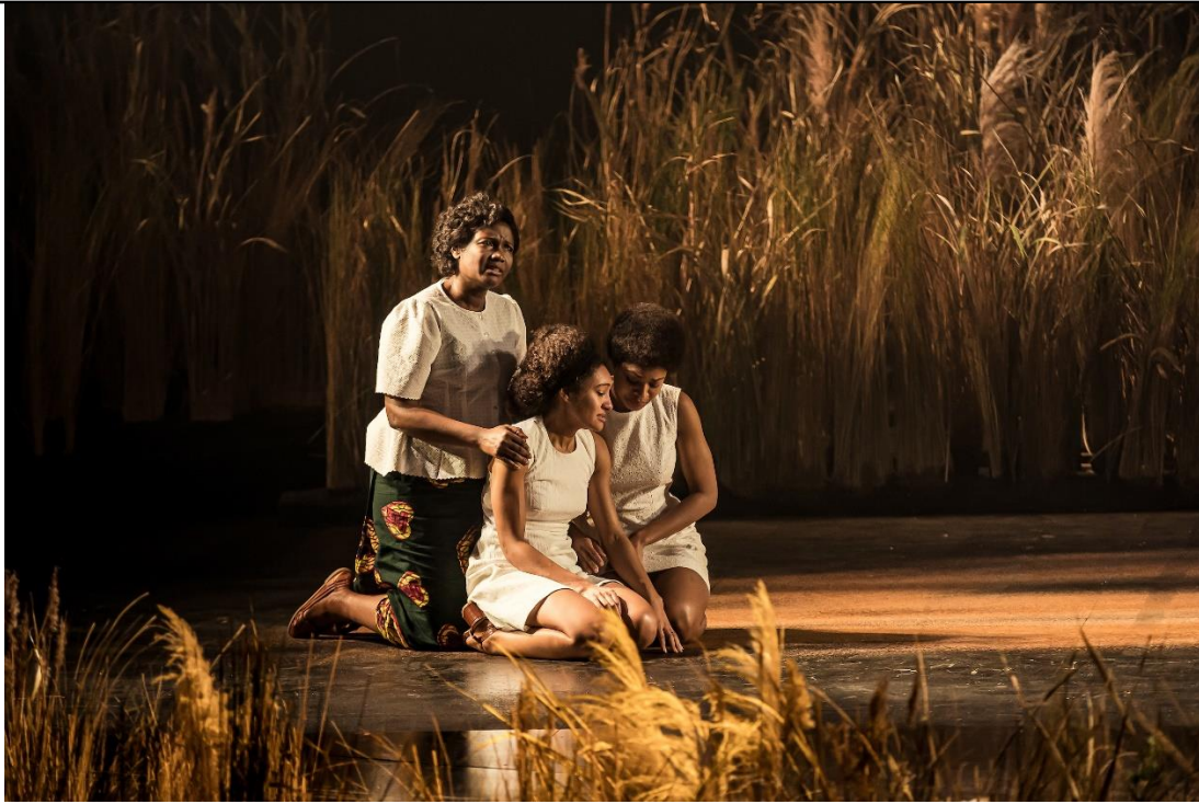
Production photograph of Three Sisters (2019).

Andrea Levy's novel Small Island , adapted for the stage by Helen Edmundson in 2019 , can also be explored in a similar way to above. Further resources available include: